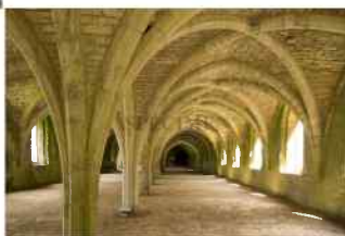
The Undercroft by Tim Bridge