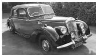
7 RMSTRNG SIDDLY